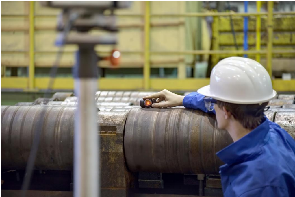
Reliable measurement of continuous caster segments and molds using the HD LASr plant assistant system from SMS group.

(60 lines of max. 65 characters per line)