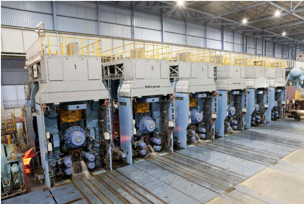
Finishing stands for the production of top-quality hot strip.