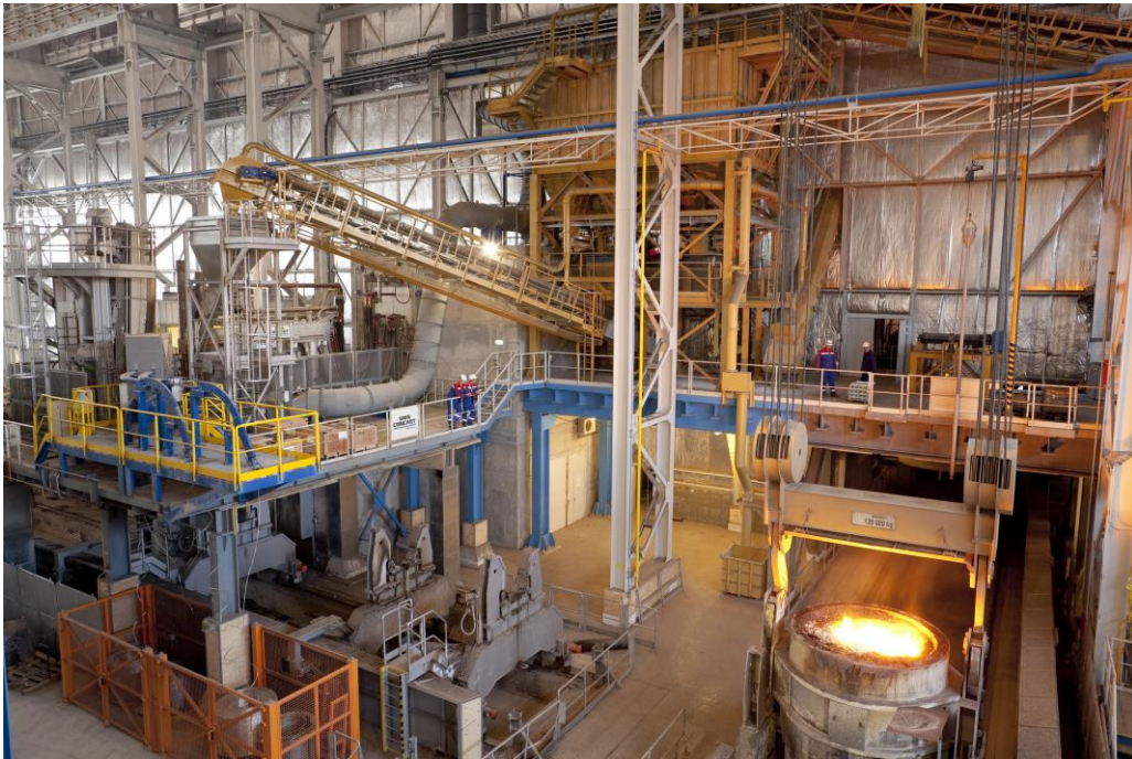
SMS group supplies minimill for the production of rebars to Moon Iron & Steel.