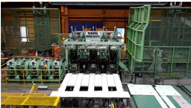
PSM ® 380/5 at Hyundai Steel, Pohang, Korea.

The SMS group is a group of companies internationally active in plant construction and mechanical engineering for the steel and nonferrous metals industry. Its 14,000 employees generate sales of over EUR 3.3 bn.