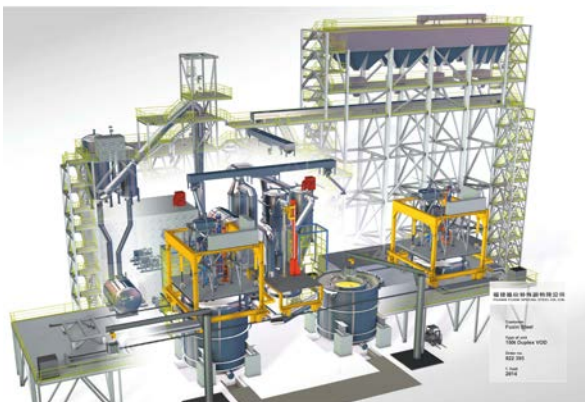
Graphic representation of the Duplex-VOD X-eed plant at Fujian Fuxin Special Steel.

SMS Mevac GmbH is a company of the SMS group which, under the roof of the SMS Holding GmbH, consists of a group of global players in machinery and plant construction in steel and nonferrous metals processing. Its workforce of more than 13,800 employees generates sales worldwide totaling EUR 3.5 billion.